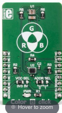
Color 8 click